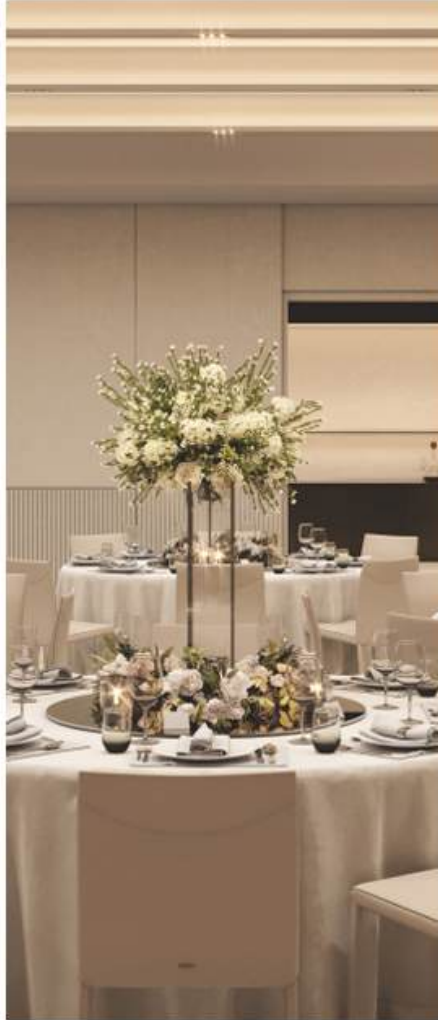
The Grand Ballroom