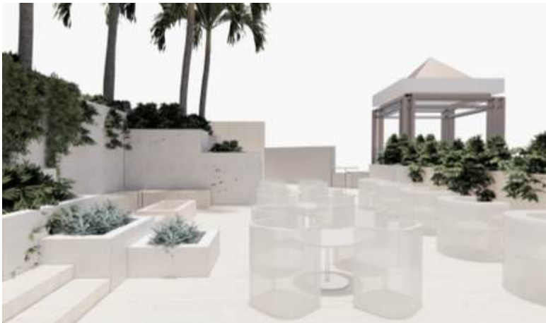
Club InterContinental Terrace