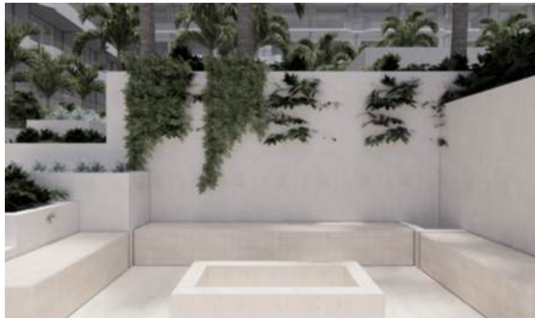
Club InterContinental Terrace