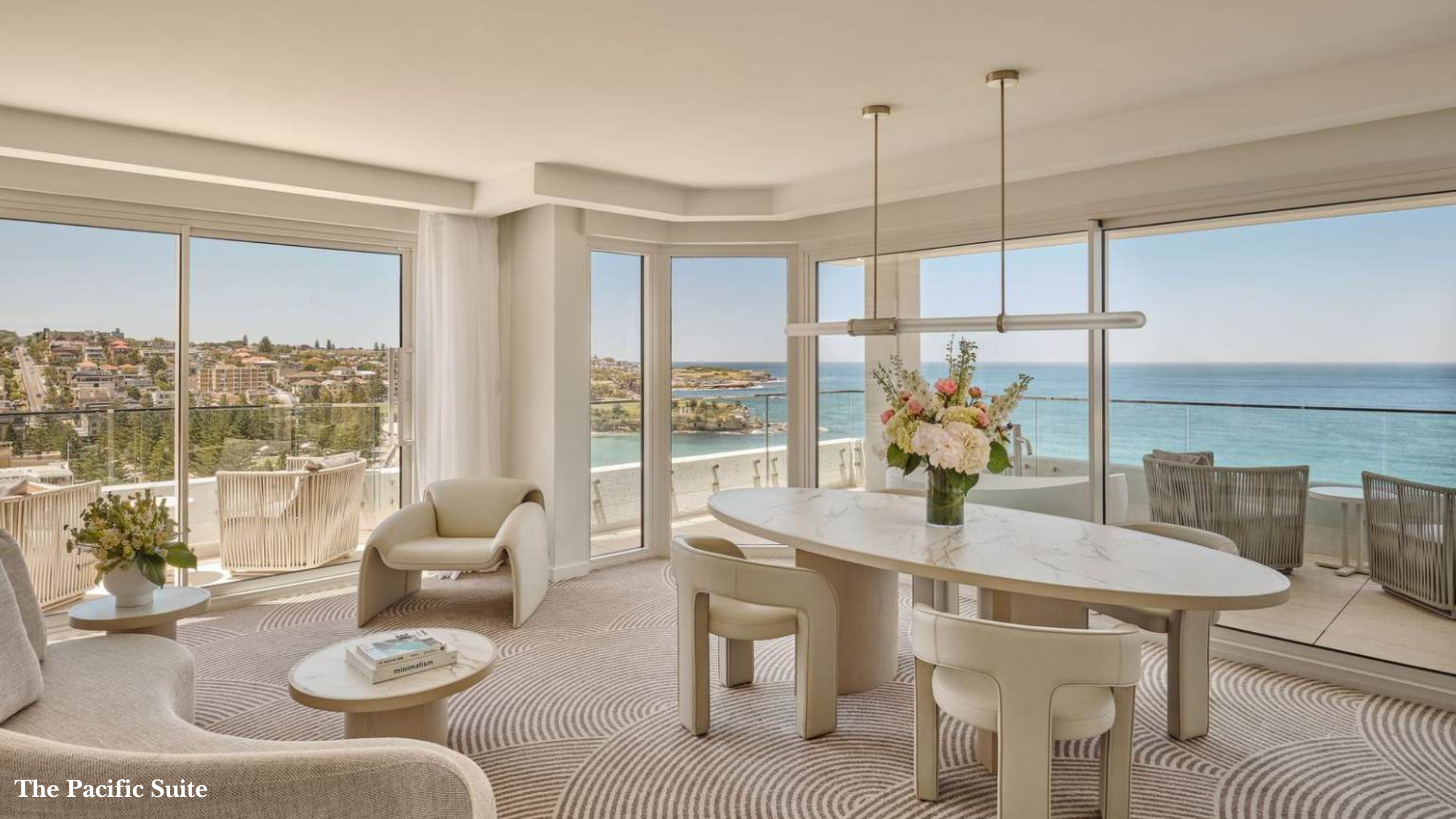
The Pacific Suite