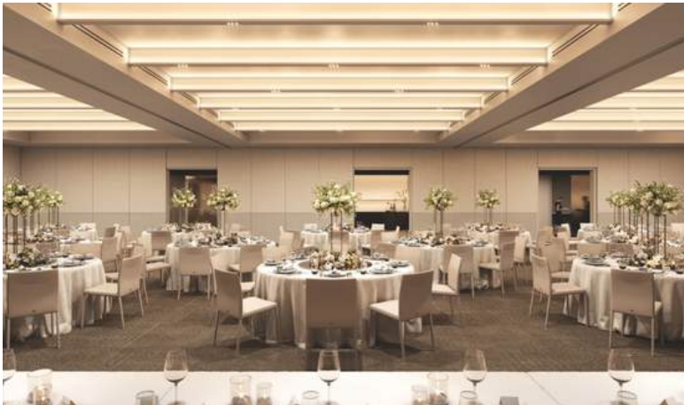
The Grand Ballroom