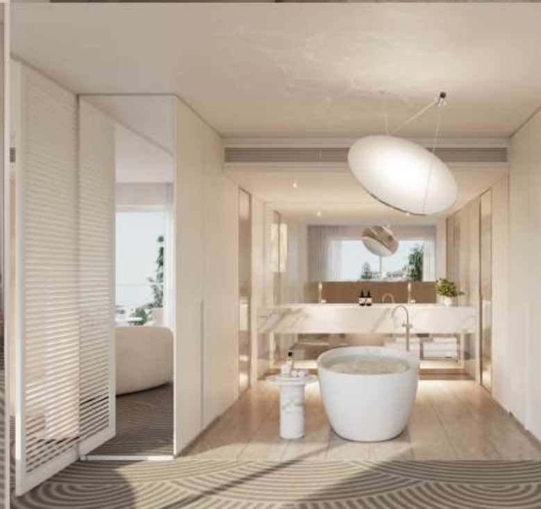
Guestrooms & Suites