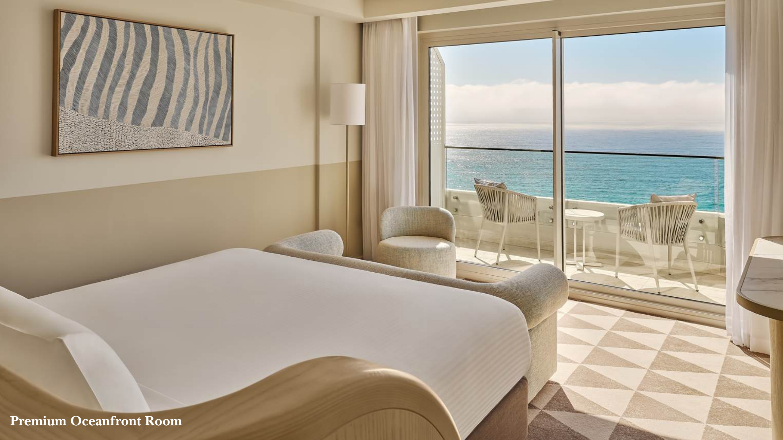
Premium Oceanfront Room