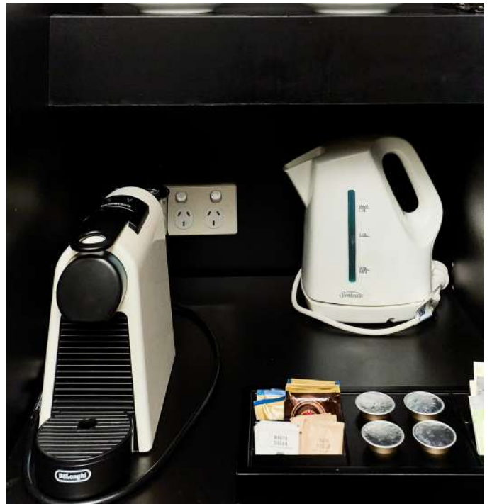
Tea & Coffee Facilities