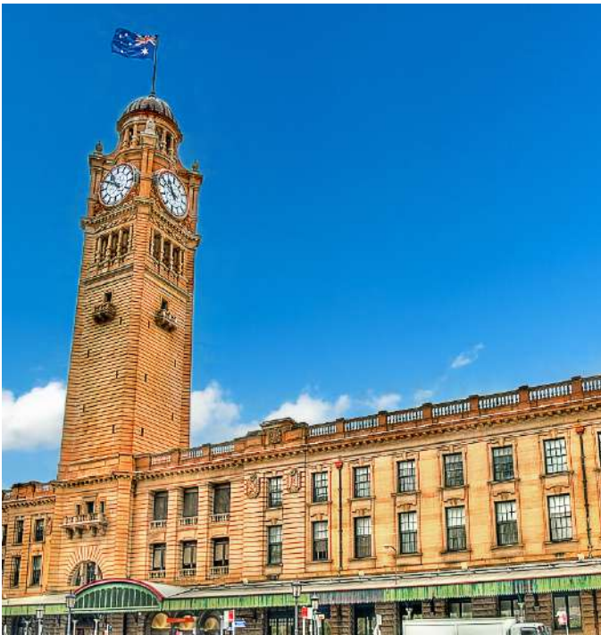
Sydney Central Station

Perfect for family getaways, our Family Room combines two interconnected spaces—Habitat King and Habitat Twin—providing ample living and sleeping arrangements for up to four adults and two children. With a King bed and two Queen beds, this setup ensures everyone can relax in style and comfort. Thoughtfully furnished with luxurious details and cutting-edge technology, it's an ideal choice for creating memorable family moments.