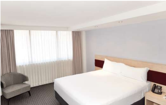
Superior King Room

Relax in a sleek and tranquil space designed for the ultimate city stay. These rooms feature luxurious pillow-topped king beds with signature bedding, 50-inch Smart TVs, high-speed Wi-Fi, and workspaces. Triple-glazed windows ensure a serene escape from the bustling streets outside.