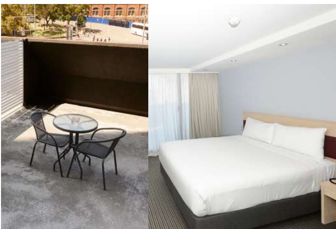
Superior Balcony Room

Elevate your stay with our Superior Balcony Rooms, which feature a private balcony offering captivating views of Sydney's vibrant streets. These spacious accommodations are designed for ultimate comfort and style, boasting a plush king bed with signature bedding, a large TV, a rain shower, and a well-equipped work desk. Triple-glazed windows ensure a peaceful escape from the city buzz, while a mini-fridge adds convenience to your stay. Step outside to your private balcony and immerse yourself in Sydney's electric energy.