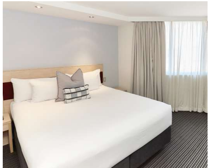
Junior Suite - Bedroom

Experience the ultimate in comfort and sophistication in the Junior Suite, a light-filled space that redefines urban luxury. Overlooking George Street, Quay Street, and Central Station, this suite features a master bedroom complete with a king bed and a dedicated workspace, as well as a separate living room furnished with a sofa and dining table. Entertainment is at your fingertips with two Smart TVs, while the walk-in pantry and connecting room options add flexibility and convenience. The suite's bathroom, with its sleek black-and-white tiling and indulgent rain shower, offers a spa-like experience. A private balcony, walk-in wardrobe, and triple-glazed windows provide the perfect finishing touches to this serene and sophisticated retreat.