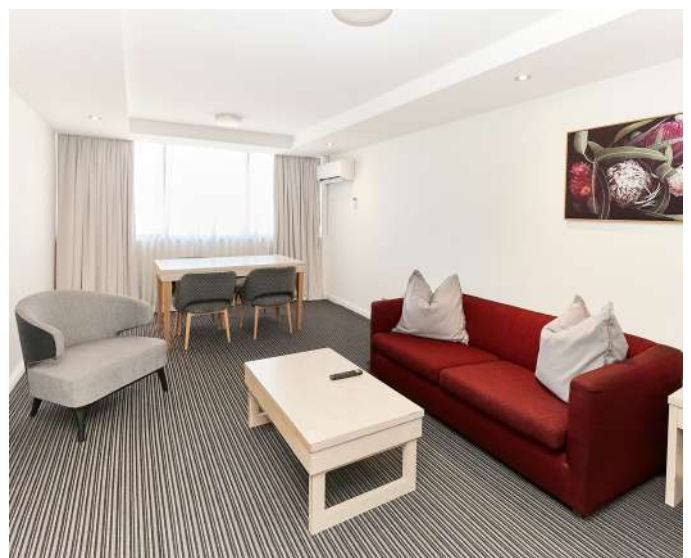
Junior Suite - Living Room